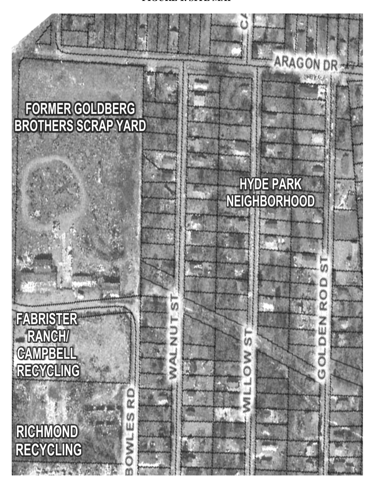
FIGURE 1. SITE MAP